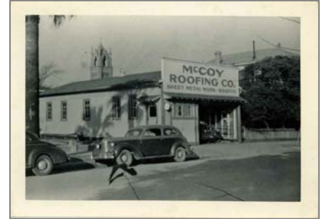
McCoy Roofing Company, 1930